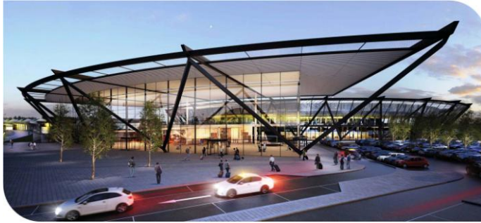
© Rogers, Stirk, Harbour + Partners

GFC Construction, the Bouygues Construction subsidiary operating in south-eastern France, has signed a contract worth €142 million with Aéroports de Lyon for the design and construction of the future Terminal 1 of Lyon-Saint Exupéry Airport. GFC Construction is the lead company of a consortium that also includes the architects RHSP and Chabanne & Partners, Technip TPS, Cap Ingélec and Inddigo.